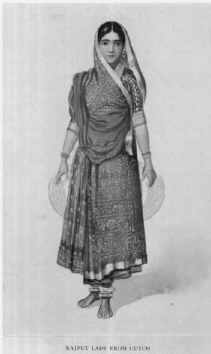
RAJPUT LADY FROM CUTCH